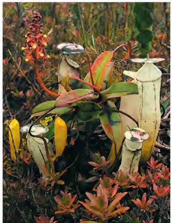
Figure 5: A stunted, flowering, N. alba plant growing on the bleak, windswept summit of Mount Tahan.